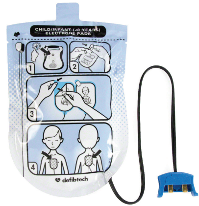
Child / Infant AED Pad