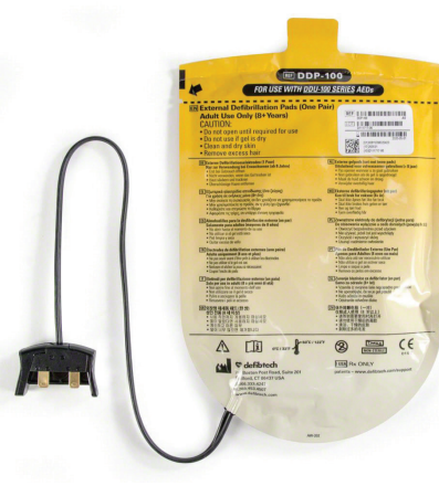
Adult AED Pad