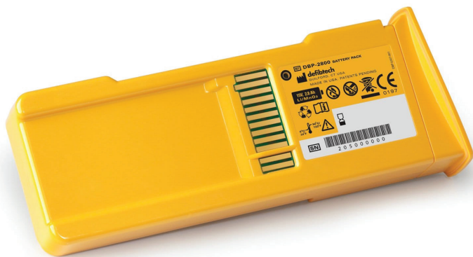
High Capacity Battery - 2800mAh